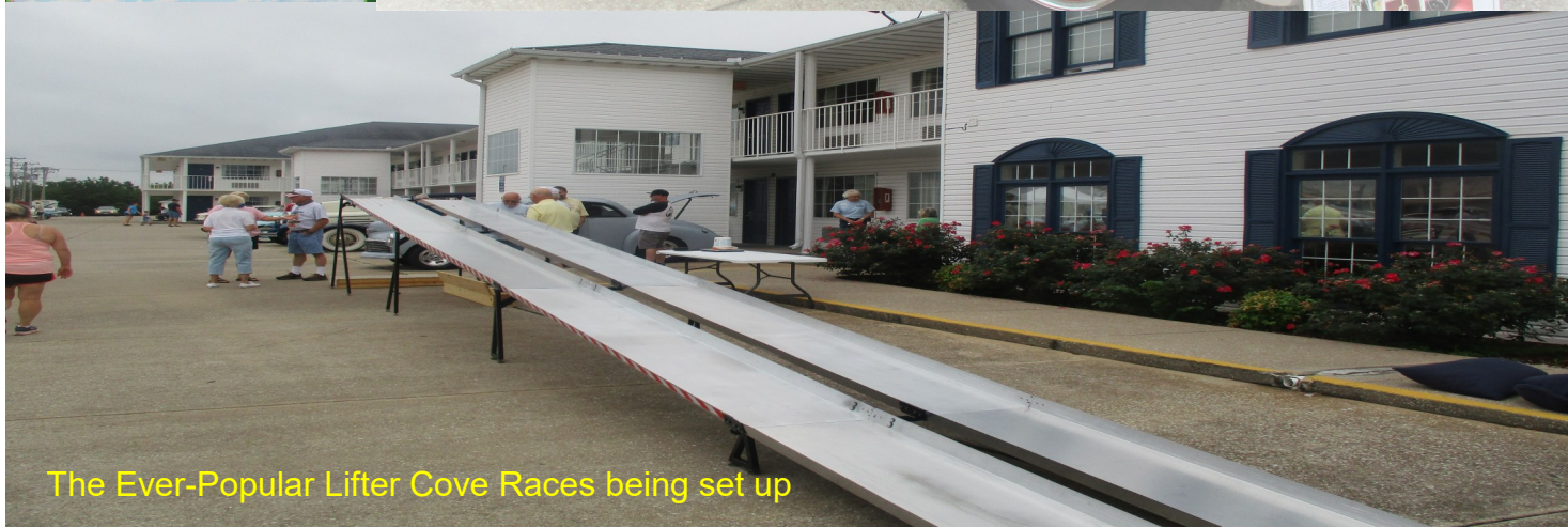
The Ever-Popular Lifter Cove Races being set up

Following Russell Snowberger's Studebaker-powered #8 Special surprise pole position at the 1931 Indianapolis 500, Studebaker debuted the Speedway edition of its roadster at the end of the model year. Studebaker made just 100 Speedway roadsters, and all had the bright Cardinal Red color of the interior, chassis, undercarriage, radiator, and wire wheels. Available only in Chessylite Gray or black, Speedway models had plenty of substance to back up those bold colors. Their 337-cu.in. engines were fitted with a higher compression 7:1 cylinder head painted Flame Red, a higher-lift camshaft, 3.47:1 rear-axle ratio, and larger throats and jets in the carburetor. A stock Speedway was taken to Dry Lake, California, and driven to 10 land speed records.