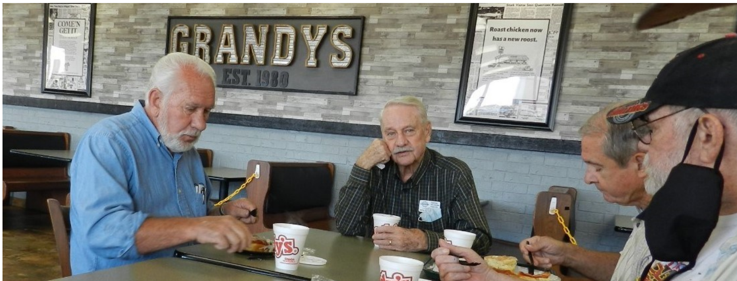
Social Distancing means "Nobody sit next to Don."

Grandy's In September, Final Cruise-In-For-Coffee at Santa Fe Steakhouse In October The Club manages to maintain a semblance of Activity