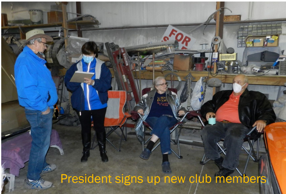
President signs up new club members