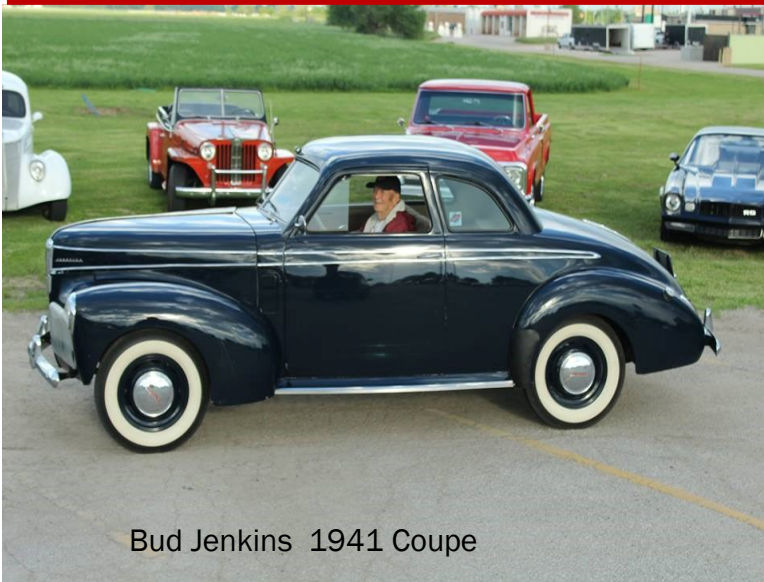
Bud Jenkins 1941 Coupe