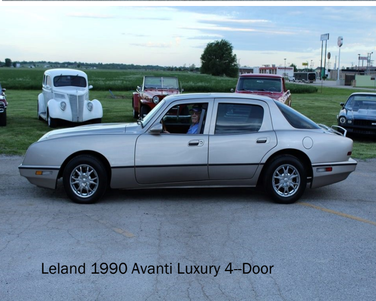
Leland 1990 Avanti Luxury 4-Door