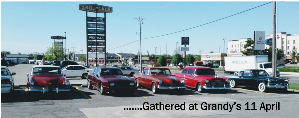
.....Gathered at Grandy's 11 April