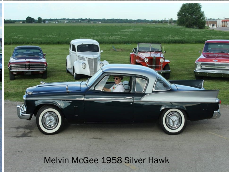
Melvin McGee 1958 Silver Hawk

Wait 'til next yeat... we'll show a lot of South Bend product there !