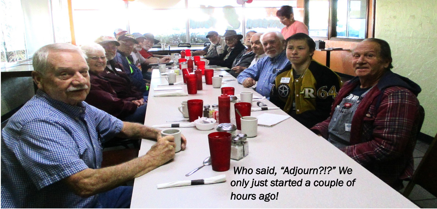
Who said, "Adjourn?!?" We only just started a couple of hours ago!