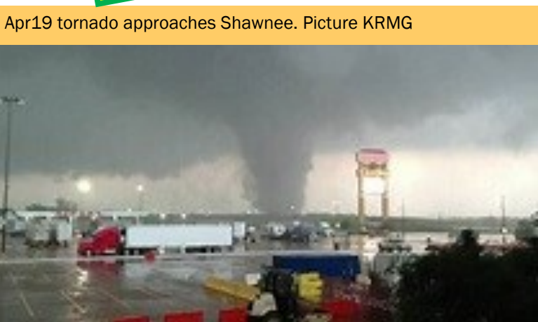
Apr19 tornado approaches Shawnee.