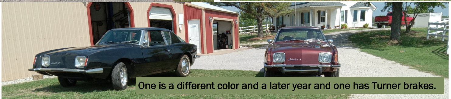
One is a different color and a later year and one has Turner brakes.