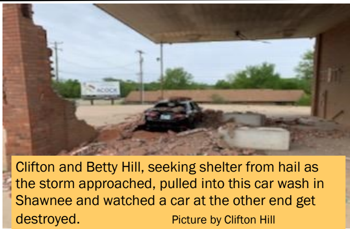
Clifton and Betty Hill, seeking shelter from hail as the storm approached, pulled into this car wash in Shawnee and watched a car at the other end get destroyed.