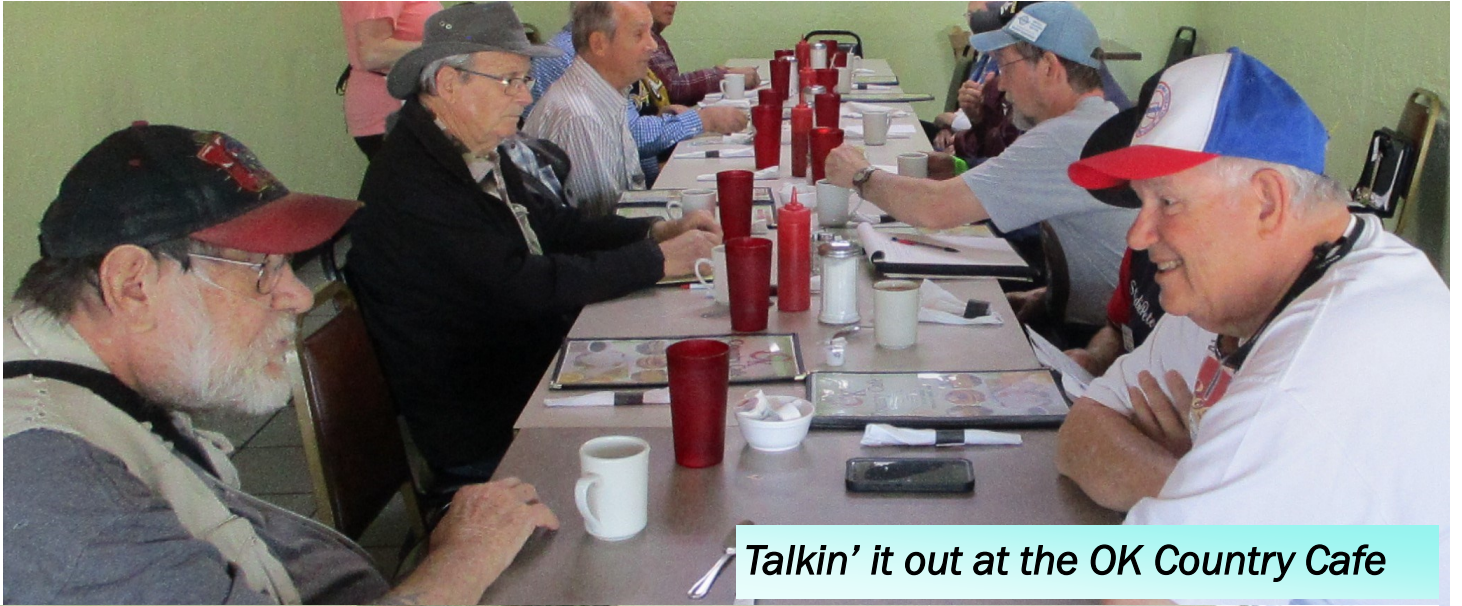
Talkin' it out at the OK Country Cafe