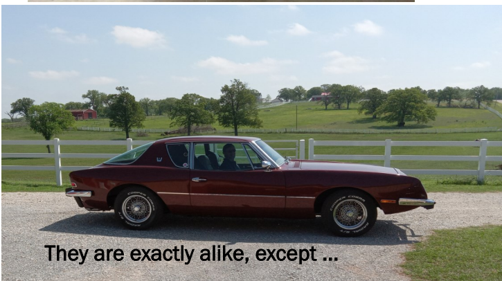
They are exactly alike, except ...

While they had the two together out at the shop at Twin Pines, they engaged in a photo shoot-out and presented here are the results of that engagement for you to admire. Send in your vote for the one you consider 'Best Done Pitcher at the Pines' to .....(I'll get back to you on that)....ed.