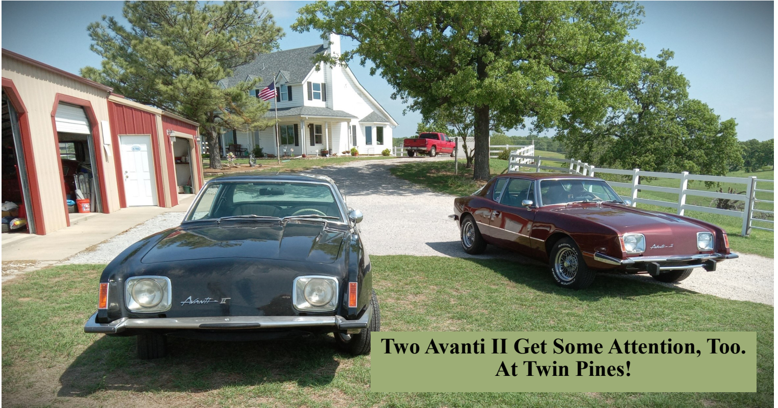
Two Avanti II Get Some Attention, Too. At Twin Pines!