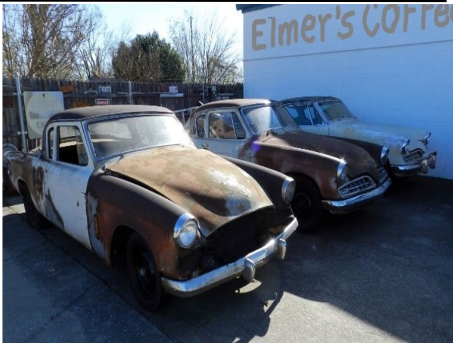
Limos await the departure of Elmer's guests on Sat 27 Feb

Ready for relief from cabin fever, club members responded en masse to the invitation to meet at Elmer's and enjoy a bit of club fellowship (lyin' a lot 'n laughin' back & forth at one another) and ate a lotta pizza and downed a few sodys. It was such a pleasure seeing so many of "the old crowd" there, surely we can soon repeat the process?